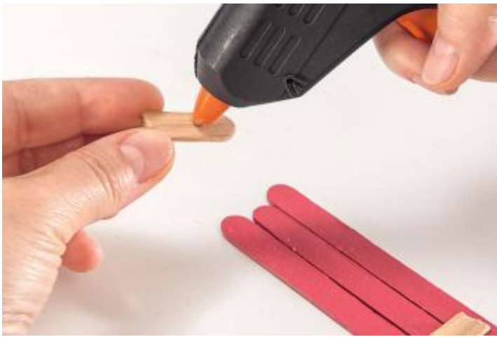
Carefully glue the Wooden sticks with the hot glue gun.