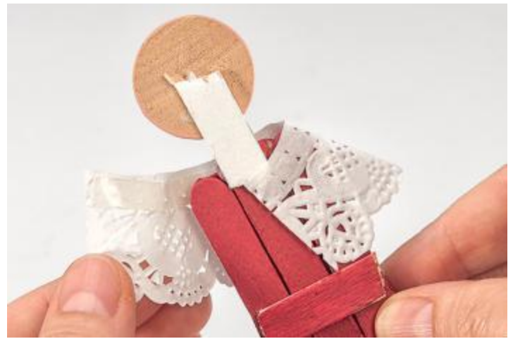
Very decorative as collar: lace paper.