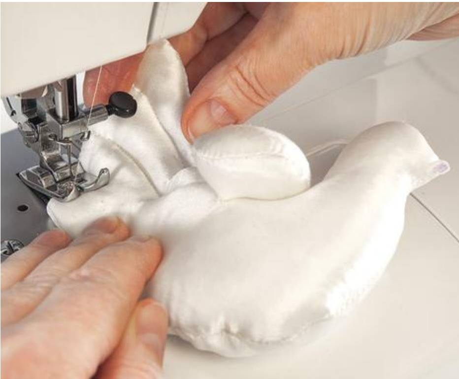
Stitch the wings and tail tip of the finished stuffed and sewn pigeon with topstitching.