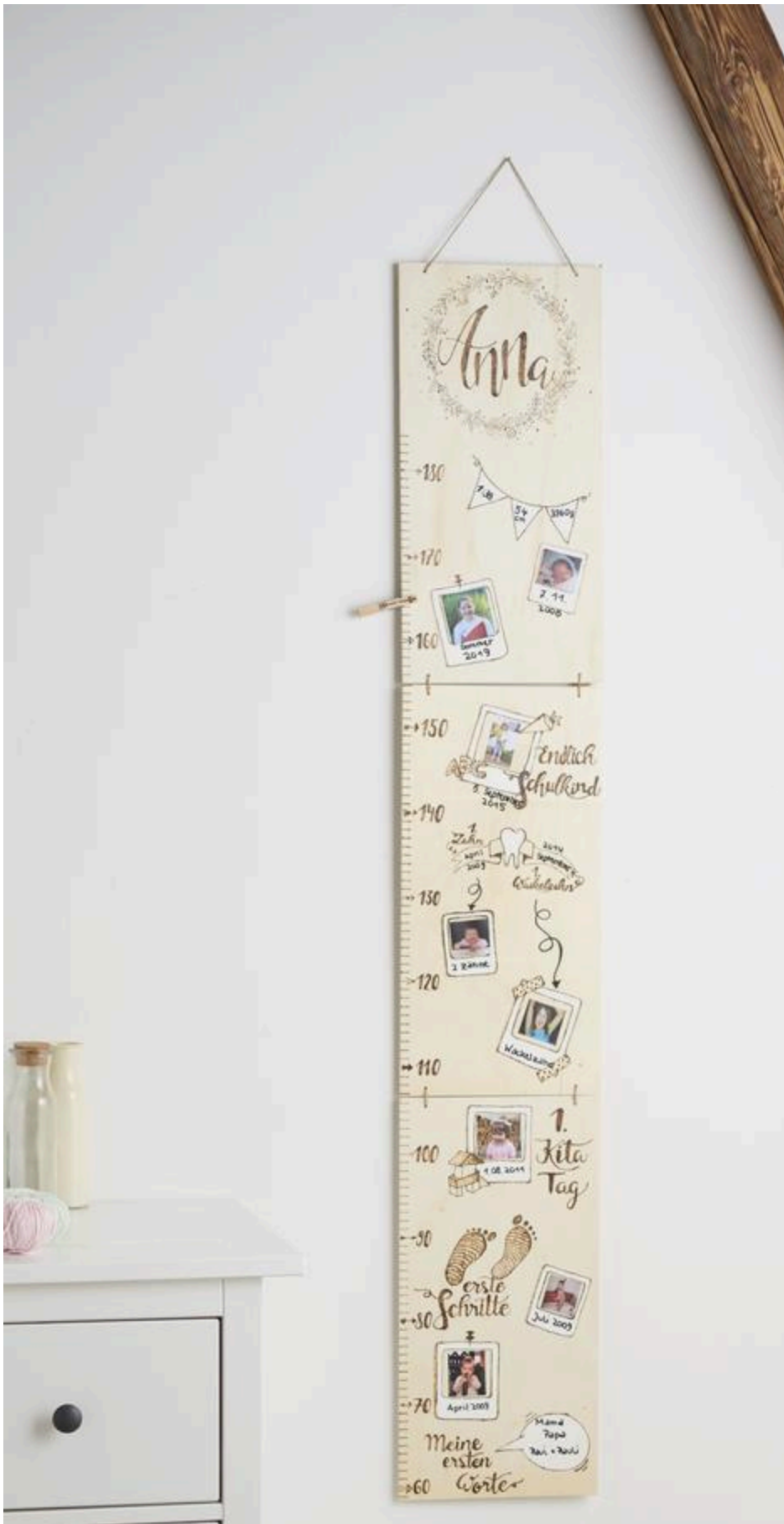
Ready designed it is an eye-catcher: