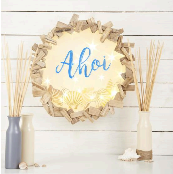
Light box "Ahoi"

The light box "Ahoi" gets its special look from the flotsam and the shell optic